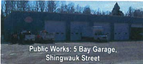
Public Works: 5 Bay Garage, Shingwauk Street

Some projects that have been approved by Garden River Band members and funded by the Community Trust include: