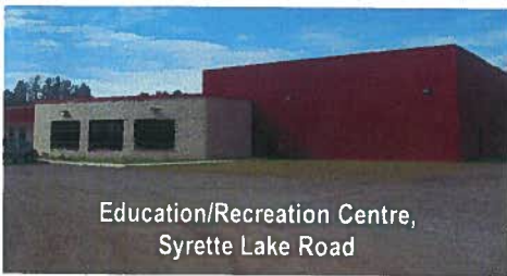
Education/Recreation Centre, Syrette Lake Road